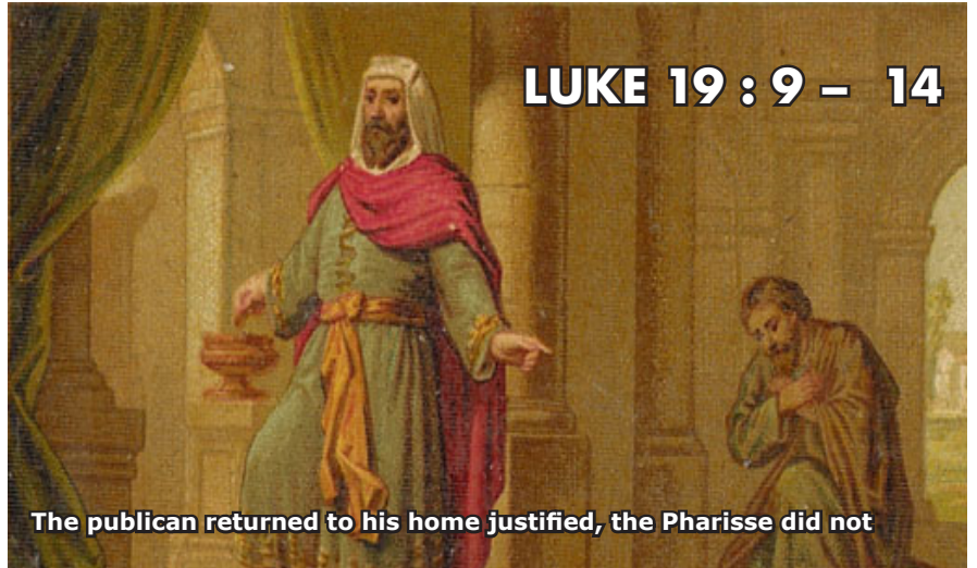
The publican returned to his home justified, the Pharisee did not

Heart of love, I put all my trust in you; for I fear all things from my own weakness, but I